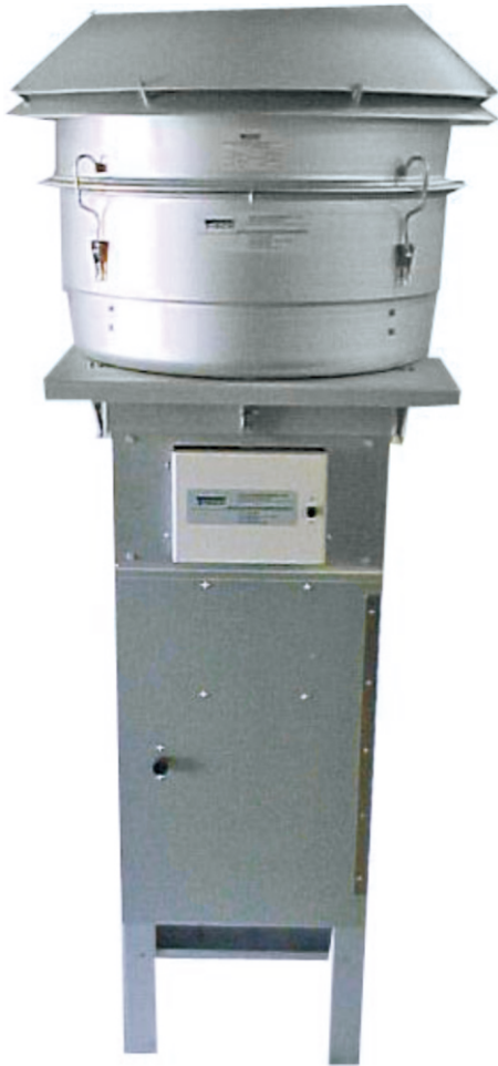
Model : 6070